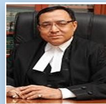
Hon'ble Justice R S Endlaw Former Judge Delhi High Court